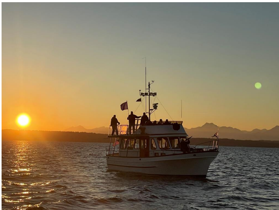
Race Committee Boat - Portage Bay