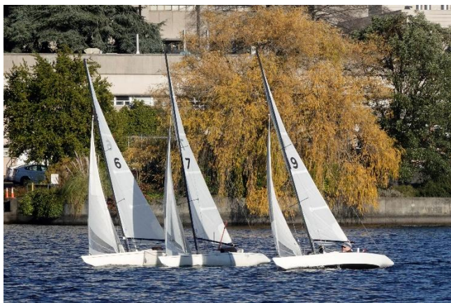
Mini-12's rail-to-rail racing on Portage Bay!

Every year we have seven series consisting of five regattas each. And with our friends at Royal Victoria Yacht Club and their ten boats, our two clubs alternate as host for an annual Inter-Club Team Race Regatta.