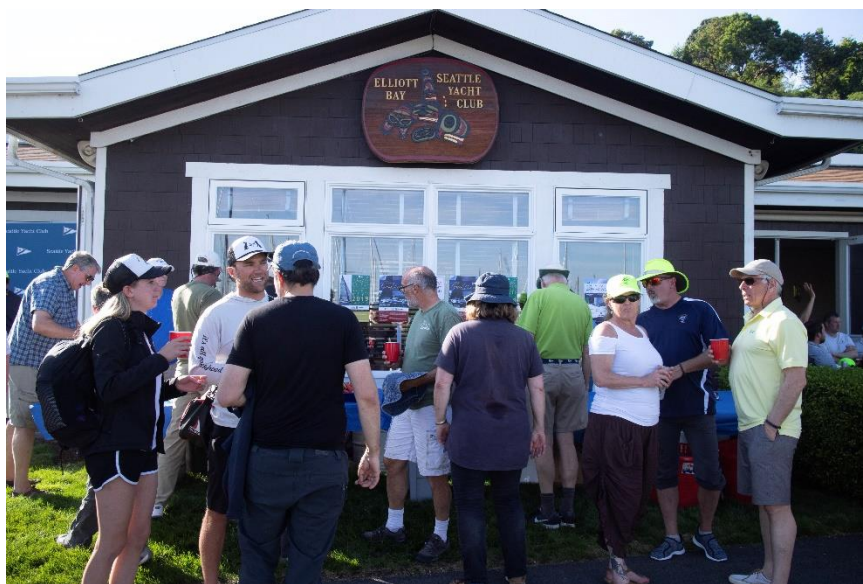
Annual Tri-Island Series Party at the Elliott Bay Marina clubhouse, following the Blake Island Race.