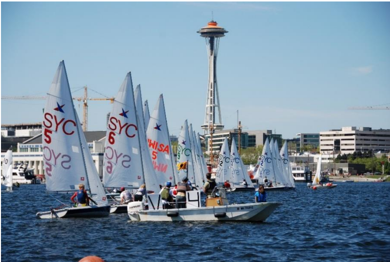
High School Sailing Championships on Lake Union.

Phone: 206.926.1011. Email: brianl@seattleyachtclub.org