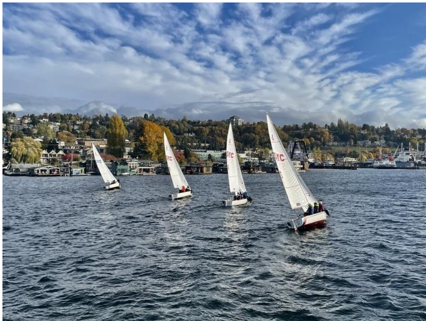
J/22 on Lake Washington