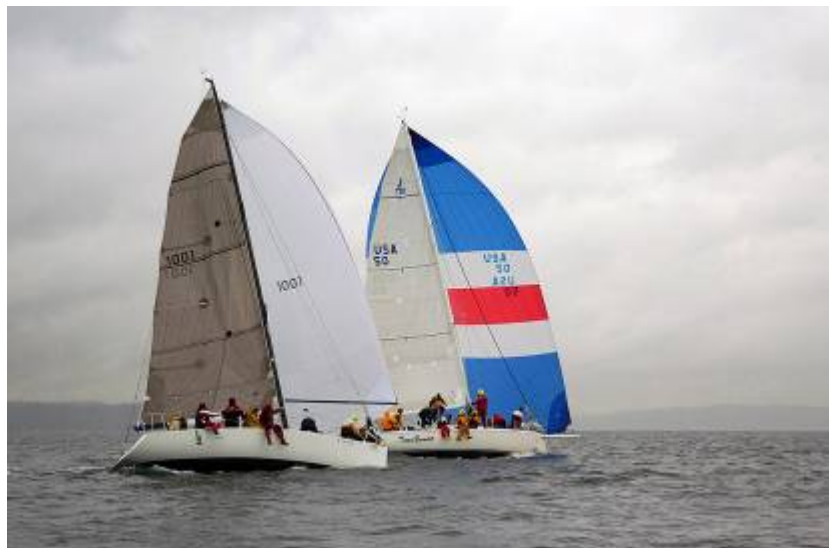
Kilo and Time Bandit reaching across the Sound