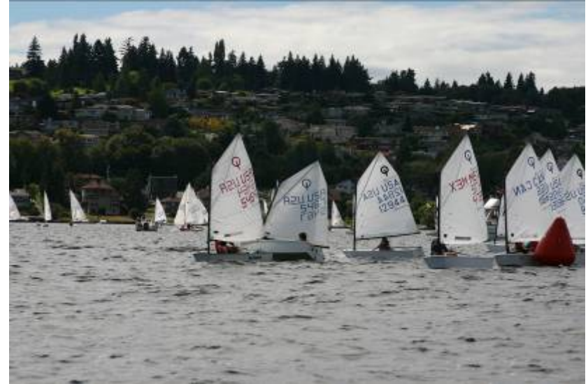
Opti's at the Northwest Youth Championships

The Junior Racing Team looks to continue its impressive accomplishments in 2006. With our previous year's team reaching national and in some cases world-level events, 2006's team looks to continue this level of achievement. The team has goals of placing members in the various US National Junior Championships, as well as in some cases pursuit of World events, and of course continued success in our regional competition, the Northwest Youth Racing Circuit. The team will continue to represent SYC and fly the burgee in junior events throughout North America and abroad, competing against the best junior sailors in the country and the world.