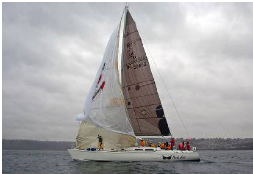
Marda Gras sets the kite