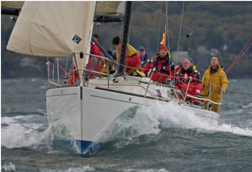
Declaration of Independence – SYC 2005 Sailboat of the Year