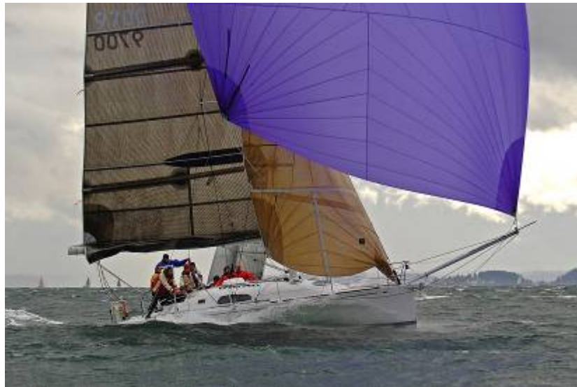
Dark Star cleared for take-off