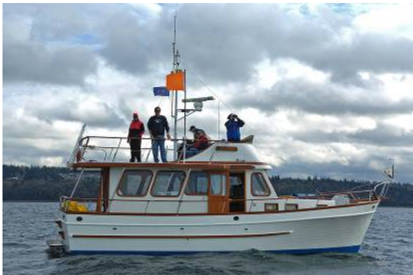
Fleet Captain Bruce Campbell and the crew on the Portage Bay