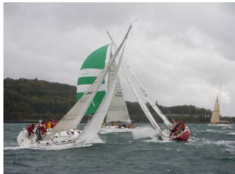
Heavy traffic with Tantivy, Shoot the Moon, and Voodoo Child