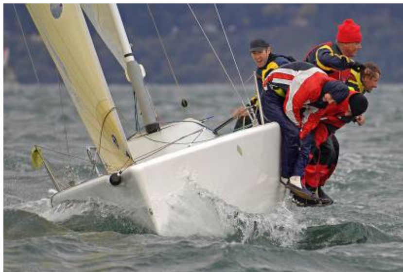
The crew of Judo Chop showing their form on the rail