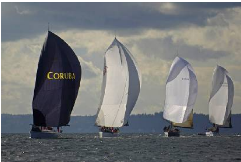
Coruba, Voodoo Child, Irene, and Flash in the Big Boat Series

The season's racing activities culminate with the 29th Annual Grand Prix Invitational Regatta. Boats must qualify for this prestigious invitation-only event. Qualification criteria can be found in the Notice of Race. You have several chances to qualify, so get out there and give it a shot. The Grand Prix puts a premium on all aspects of racing by featuring both buoy and distance racing over a three-day period with parties every evening. What a great way to wrap up the racing season!