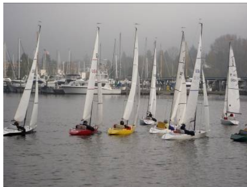
The Deception Twelve Class Fleet – growing every year