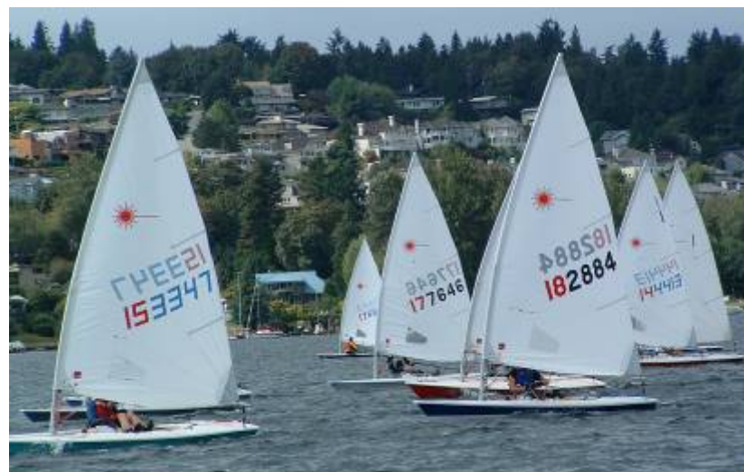
The Radial fleet heading upwind at the Northwest Youth Championships

Registration forms and class schedules can be obtained from the SYC Web site ( http://www.seattleyachtclub.org/Sailboat/Sailboat/Junior/2006_Sail_School_Brochure_Web.pdf ), at SYC's Portage Bay Club House, or through the Director of Sailing's Office.