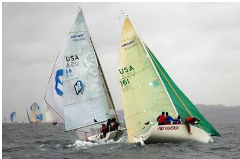
Puttanesca and Goose & Duck in tight competition at Grand Prix