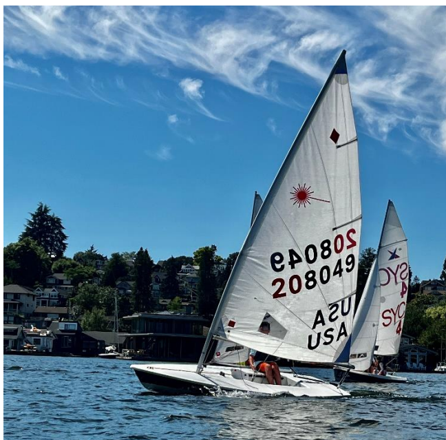
Laser and Vanguard 15 on Portage Bay