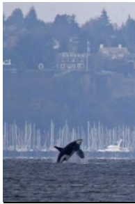
Save the Orcas