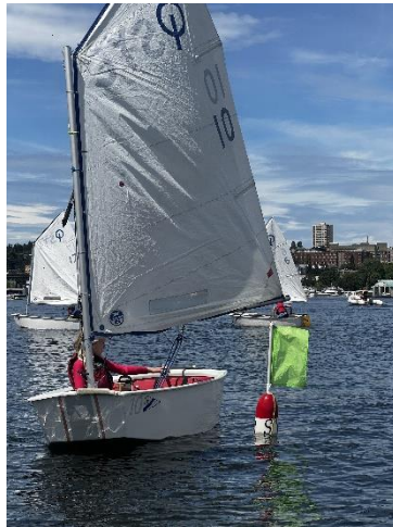
Opti sailing in Portage Bay

This year's program will run from June 15 to September 4. Classes run from 9:00 AM - 4:00 PM, Monday through Friday. Students can sign up for a week at a time, and for multiple weeks during the summer!!