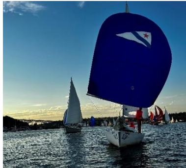
J/22 on Lake Union