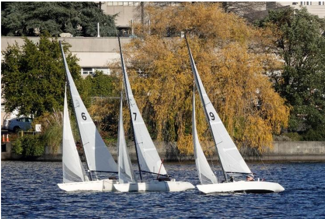
Mini-12's rail-to-rail racing on Portage Bay!

Every year we have seven series consisting of five regattas each. And with our friends at Royal Victoria Yacht Club and their ten boats, our two clubs alternate as host for an annual Inter-Club Team Race Regatta.