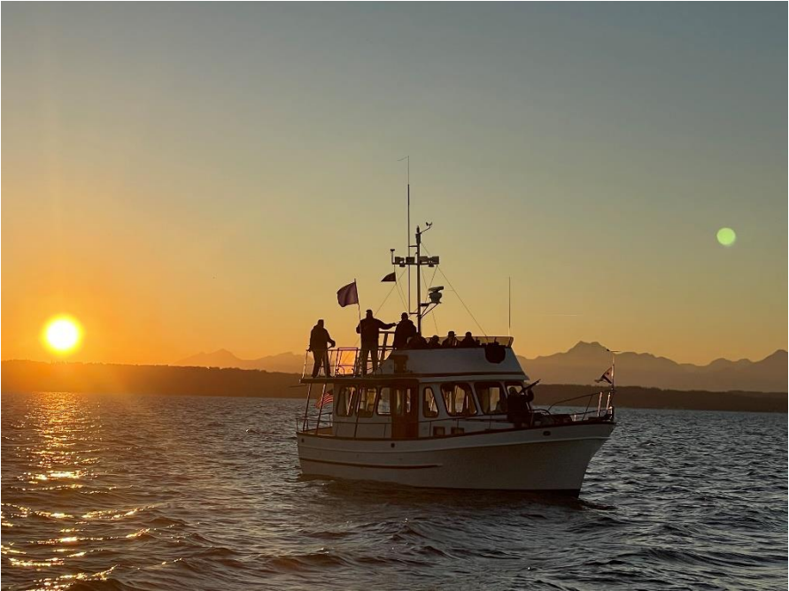
Race Committee Boat - Portage Bay