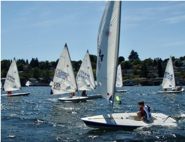
Laser sailing in Portage Bay

Program typically runs from mid-June through late August. Classes run from 9:00 AM - 4:00 PM, Monday through Friday. Students can sign up for a week at a time, and for multiple weeks during the summer!!