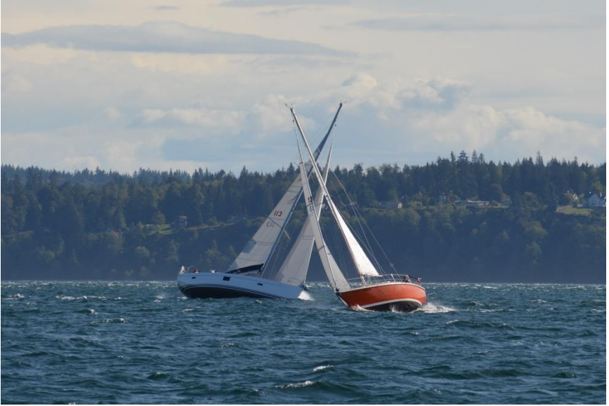
First annual Ludlow Double Dipper in 2019