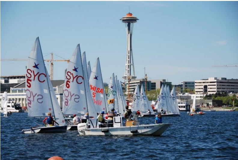
High School Sailing Championships on Lake Union.