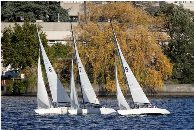
Mini-12's rail-to-rail racing on Portage Bay!

Every year we have seven series consisting of five regattas each. And with our friends at Royal Victoria Yacht Club and their ten boats, our two clubs alternate as host for an annual Inter-Club Team Race Regatta.