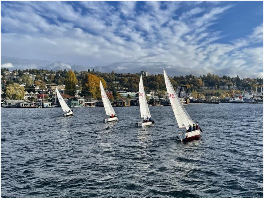
J/22 on Lake Washington