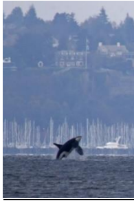
Save the Orcas