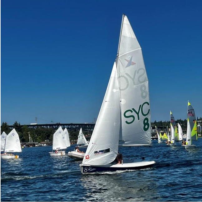
Optis, Fevas and Vanguard 15s on Portage Bay