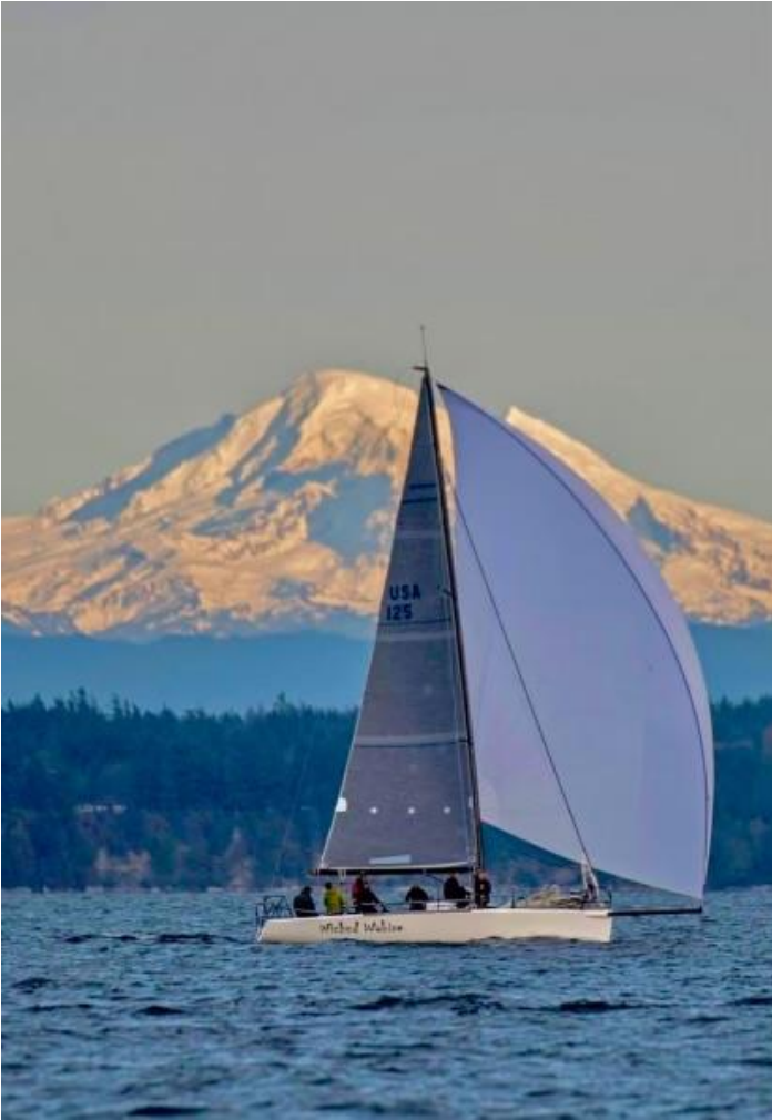
Wicked Wahine, amazing memories of Darrin Towe.