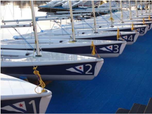
Vanguard 15: multi-purpose, double-handed one design (fun too)

To help promote High School Sailing in Seattle and create a place for graduates of our sailing school to begin participating in the sport, we are now offering a membership to the SYC Race Team for the High School season.