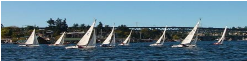
Mini-12's racing on Portage Bay

Every year we have seven series consisting of five regattas each. And with our friends at Royal Victoria Yacht Club and their ten boats, our two clubs alternate as host for an annual Inter-Club Team Race Regatta. The Interclub Regatta will be held at Royal Vancouver Yacht Club, April 9 - 10, 2016.