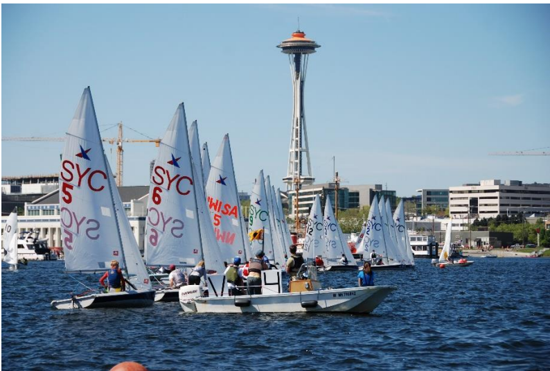
High School Nationals on Lake Union