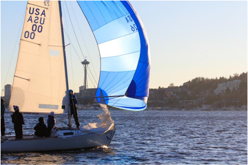
J/22 on Lake Union

Enjoy the individual attention and customized instruction of private lessons at Seattle Yacht Club. Whether you're looking to learn from scratch, refresh your basic sailing skills, or learn more advanced techniques, private lessons provide the opportunity to learn what you want when you want.