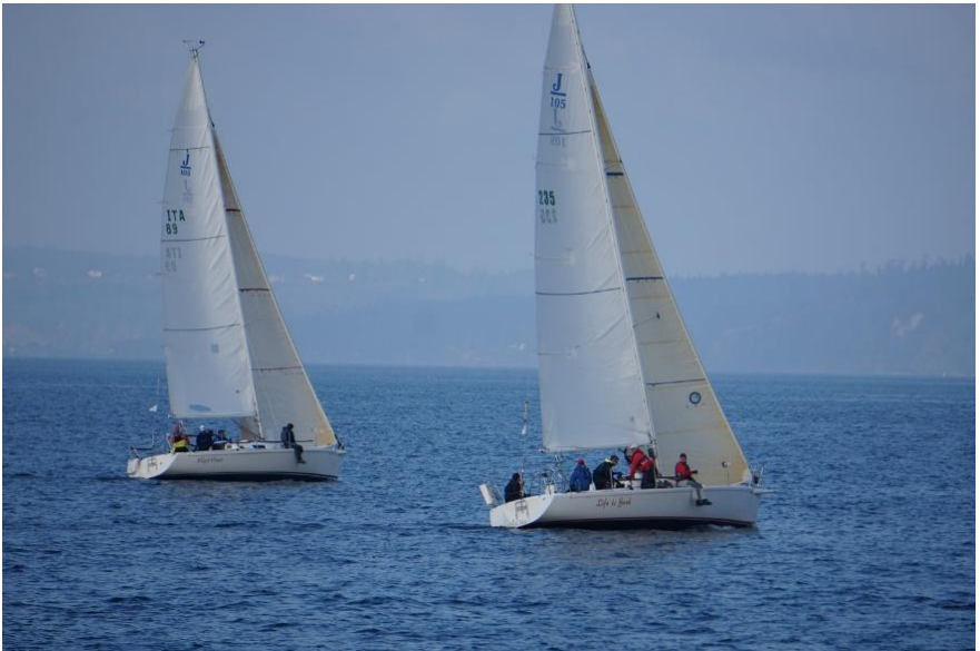
J-105s crossing the Sound during Tri-Island Series.