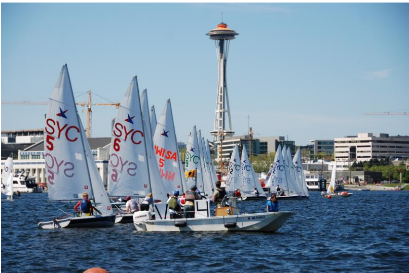
High School Nationals on Lake Union