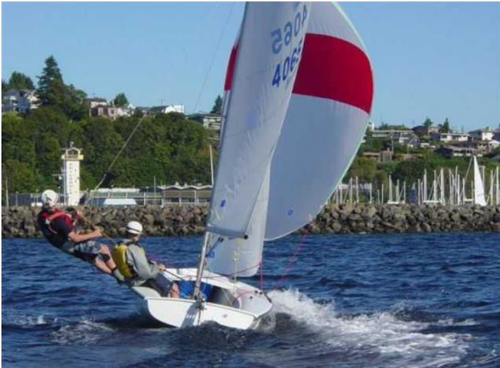
Double-handed 420 in Shilshole Bay

Enjoy the individual attention and customized instruction of private lessons at Seattle Yacht Club. Whether you're looking to learn from scratch, refresh your basic sailing skills, or learn more advanced techniques, private lessons provide the opportunity to learn what you want when you want.