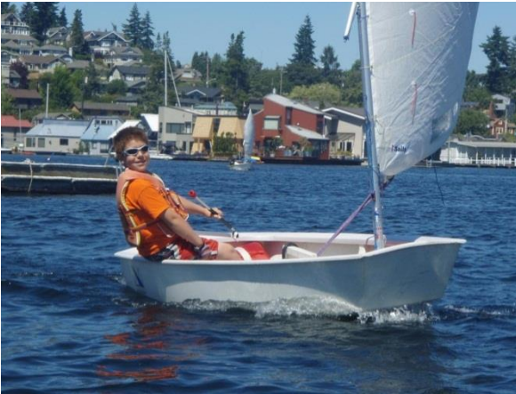
Opti sailing in Portage Bay

This year's program will run from June 22 through August 28, 2015. Classes run from 9:00 AM - 4:00 PM, Monday through Friday. Students can sign up for a week at a time.