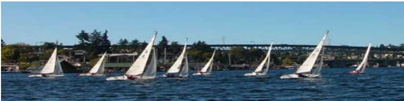
Mini-12's racing on Portage Bay

Every year we have seven series consisting of five regattas each. And with our friends at Royal Victoria Yacht Club and their ten boats, our two clubs alternate as host for an annual Inter-Club Team Race Regatta. The Interclub Regatta will be held at Royal Vancouver Yacht Club, April 11-12, 2015.