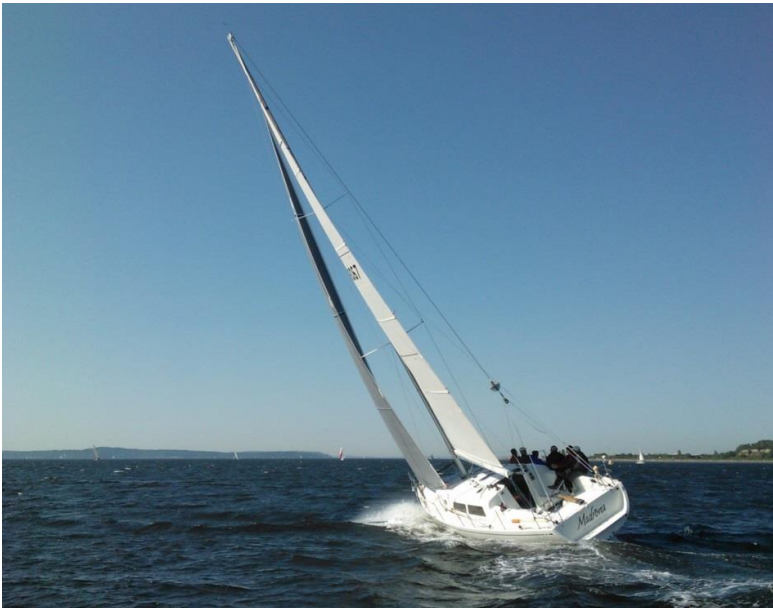
Madrona approaching West Point in the Vashon Island Race.

See Notices of Race for individual event chairpersons.