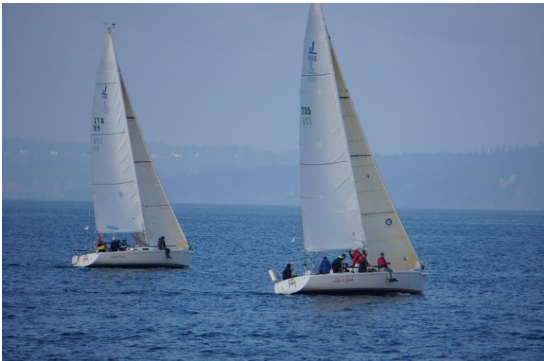
J-105s crossing the Sound during Tri-Island Series.