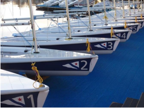
Vanguard 15: multi-purpose, double-handed one design (fun too)

To help promote High School Sailing in Seattle and create a place for graduates of our sailing school to begin participating in the sport, we are now offering a membership to the SYC Race Team for the High School season.