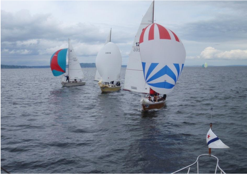
The Star & Bar Regatta stands ready to serve one design fleets.