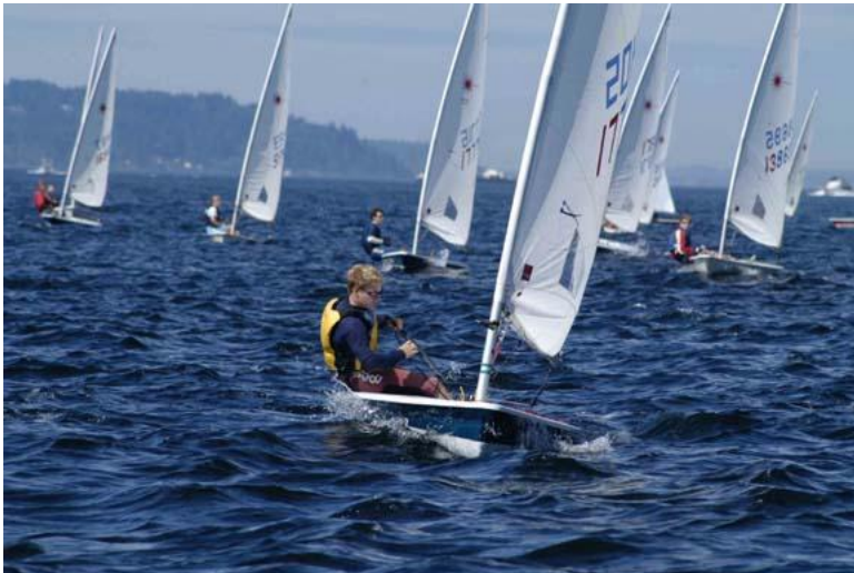
Juniors racing the Olympic class Laser and Laser Radial.