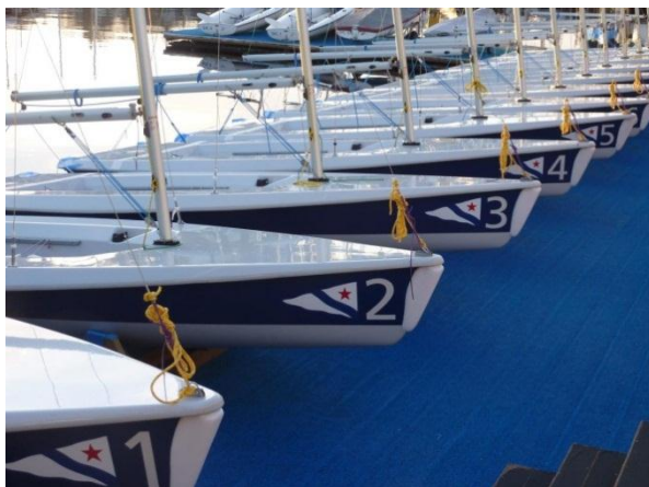
Vanguard 15: Seattle Yacht Club's multi-purpose, double-handed fleet.

To help promote High School Sailing in Seattle and create a place for graduates of our sailing school to begin participating in the sport, we are now offering a membership to the SYC Race Team for the High School season.