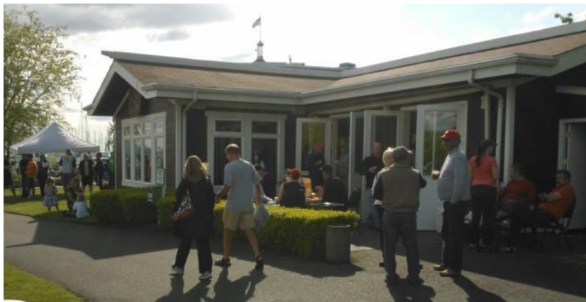
Tri-Island Series parties are hosted at the Elliott Bay Marina clubhouse.