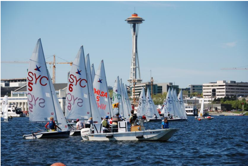
High School Nationals on Lake Union