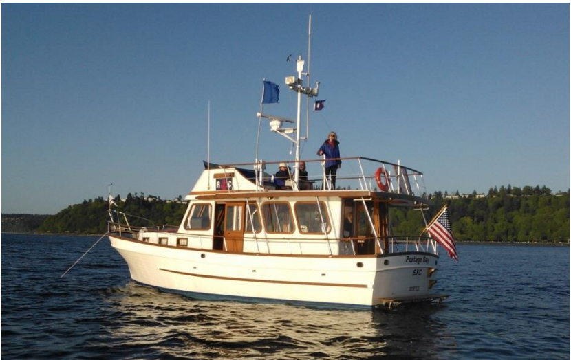
m/v Portage Bay