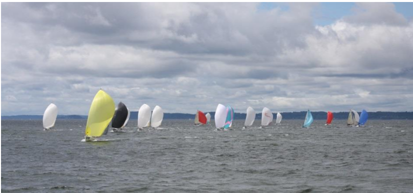
A fine day at the 2012 CSR Marine Melges 24 US Nationals