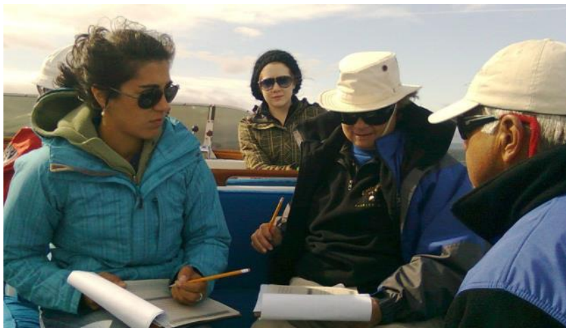
Sharing race committee know-how at the Star & Bar Regatta