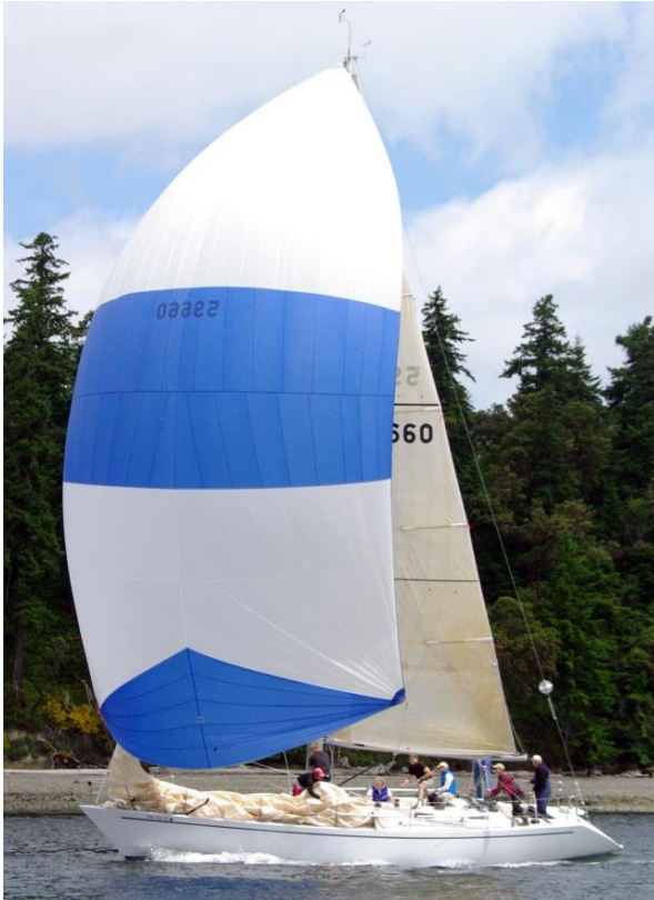
Sachem – Seattle Yacht Club 2012 Sailboat of the Year