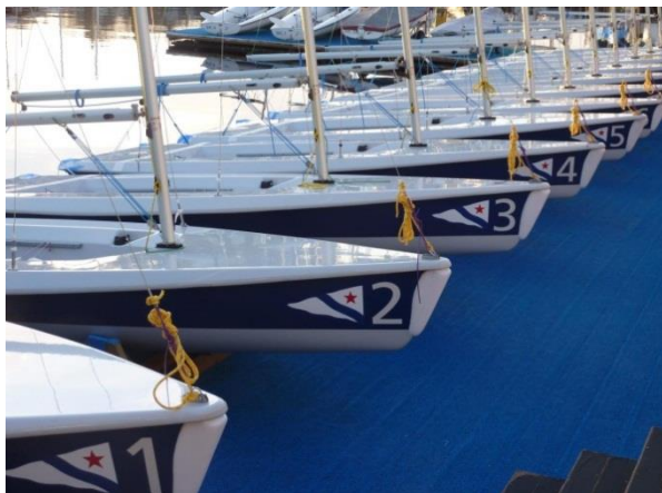
Vanguard 15: multi-purpose, double-handed one design (fun too)

To help promote High School Sailing in Seattle and create a place for graduates of our sailing school to begin participating in the sport, we are now offering a membership to the SYC Race Team for the High School season.