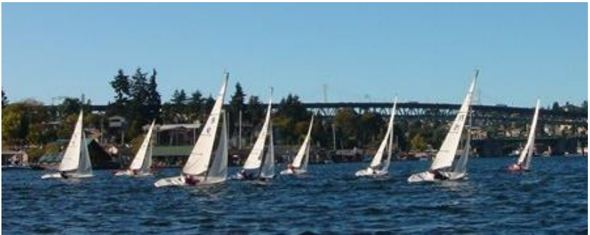
Mini-12's racing on Portage Bay

Every year we have seven series consisting of five regattas each. And with our friends at Royal Victoria Yacht Club and their ten boats, our two clubs alternate as host for an annual Inter-Club Team Race Regatta..