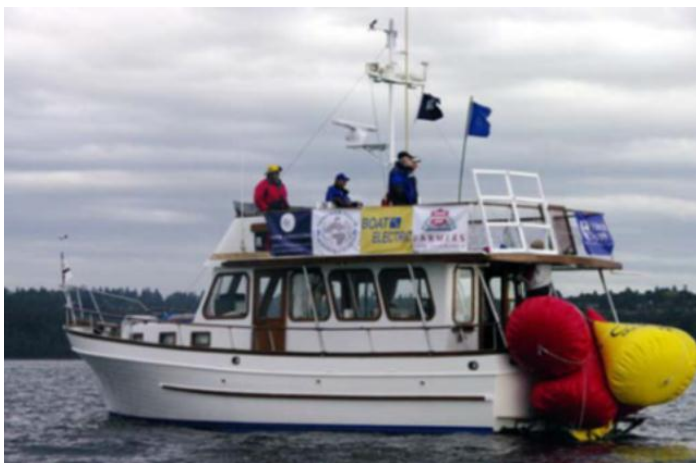
m/v Portage Bay