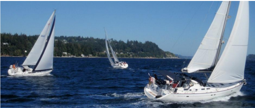
Cruiser/Racer competition at SYC Tri-Island, Cruise & Snooze, and Fall Equinox

The season's racing activities culminate with the Grand Prix Invitational Regatta. Boats must qualify for this prestigious invitation-only event. Qualification criteria can be found in the Notice of Race. Whole one design fleets with representative qualifiers may also be invited. You have several chances to qualify, so get out there and give it a shot. Grand Prix tests buoy racing skills and, if conditions are right, middle distance racing skills over a three-day period with parties every evening. What a great way to wrap up the racing season!