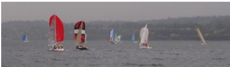
Keeping it upright at Grand Prix