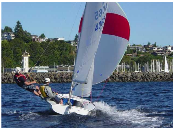
Double-handed 420 in Shilshole Bay

Enjoy the individual attention and customized instruction of private lessons at Seattle Yacht Club. Whether you're looking to learn from scratch, refresh your basic sailing skills, or learn more advanced techniques, private lessons provide the opportunity to learn what you want when you want.