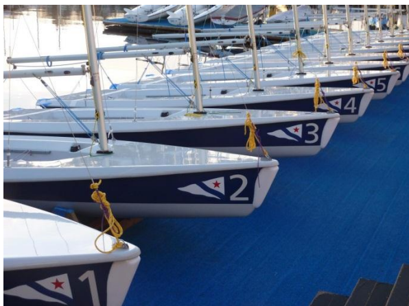
Vanguard 15: multi-purpose, double-handed one design (fun too)

To help promote High School Sailing in Seattle and create a place for graduates of our sailing school to begin participating in the sport, we are now offering a membership to the SYC Race Team for the High School season.