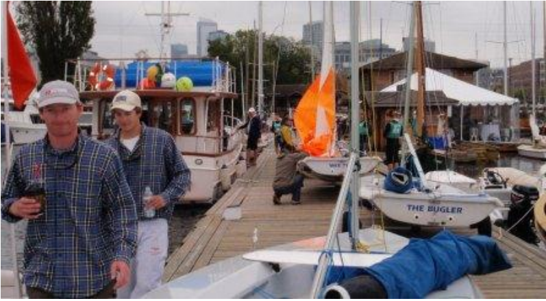
US National Team Race Championship competitors getting ready