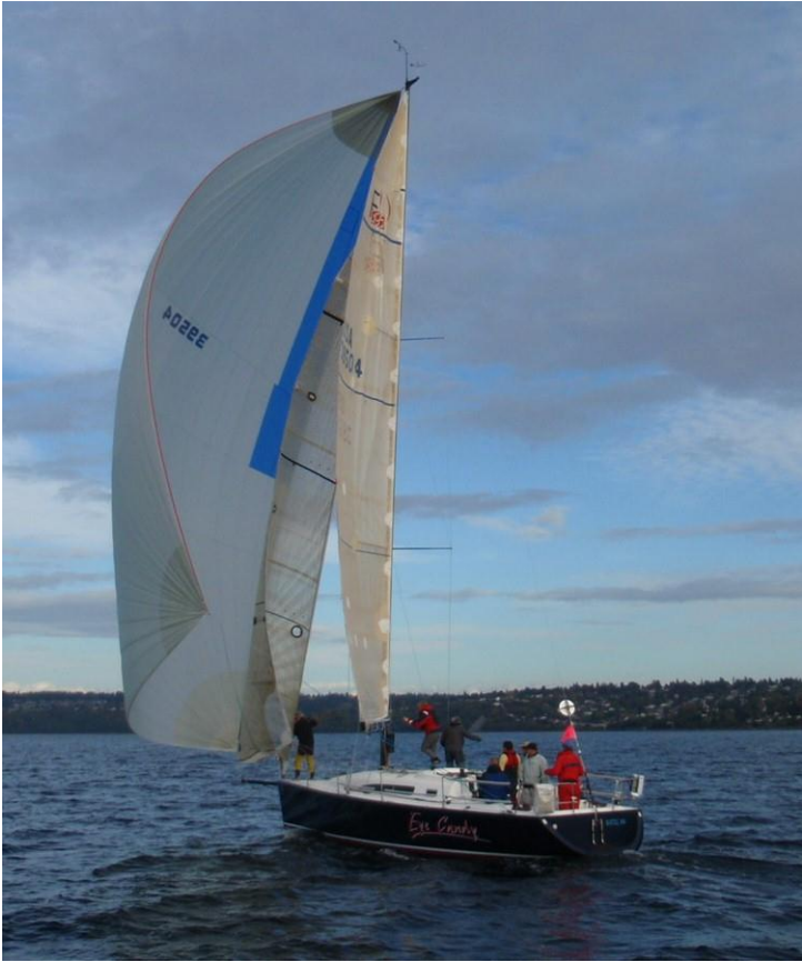
Eye Candy – SYC 2010 Sailboat of the Year