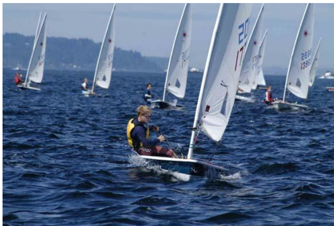
The Olympic class Laser, Laser Radial, and Laser 4.7