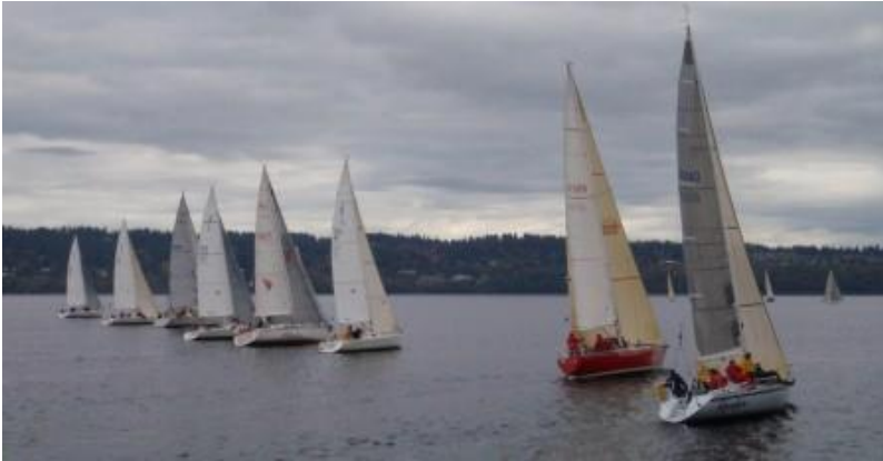
A nice start at Grand Prix in light air