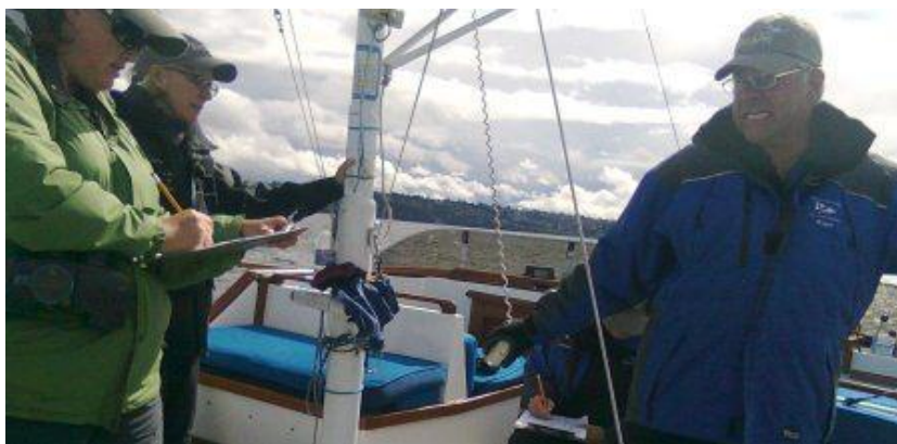
Race committee volunteers finishing boats aboard Portage Bay

Mike Milburn, 206-780-2525, milburn69802@msn.com