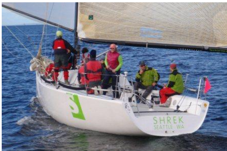
Skipper spotted trimming spinnaker, hang on