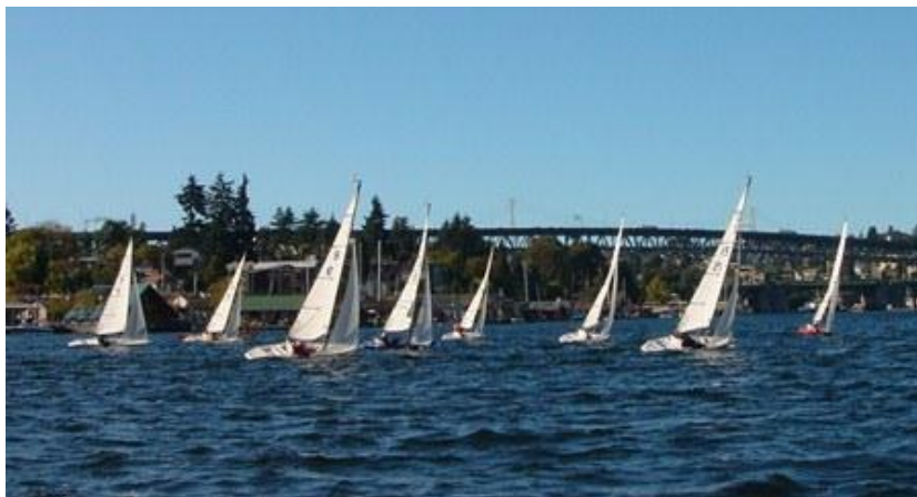
Mini-12 Fleet Action on Portage Bay

See Notices of Race for individual event chairpersons.