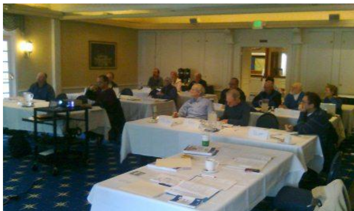
US Sailing Race Management Seminar at SYC Thank you Race Committee Volunteers!