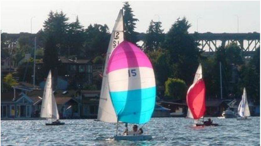
Mini-12's racing on Portage Bay

Every year we have seven series consisting of five regattas each. And with our friends at RVicYC and their ten boats, our two clubs alternate as host for an annual Inter-Club Team Race Regatta.