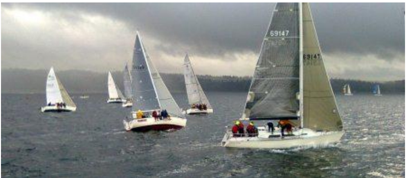
Thank you for racing and making our sport stronger. Every boat counts! (Photo of Star & Bar Regatta)

Phone: 206.926.1011. Fax: 206.324.8784. Email: BrianL@seattleyachtclub.org