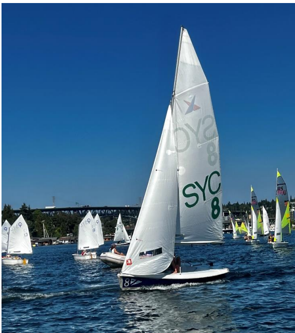
Opti, Fevas and Vanguard 15s on Portage Bay