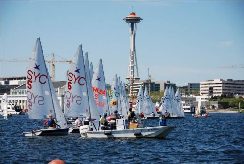
High School Sailing Championships on Lake Union.