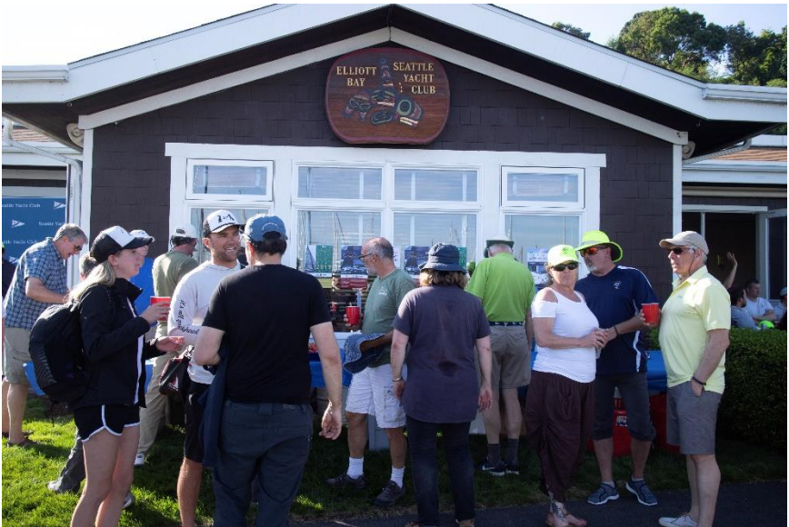
Annual Tri-Island Series Party at the Elliott Bay Marina clubhouse, following the Blake Island Race.