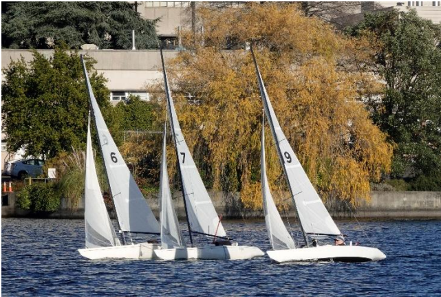
Mini-12's rail-to-rail racing on Portage Bay!

Every year we have seven series consisting of five regattas each. And with our friends at Royal Victoria Yacht Club and their ten boats, our two clubs alternate as host for an annual Inter-Club Team Race Regatta.