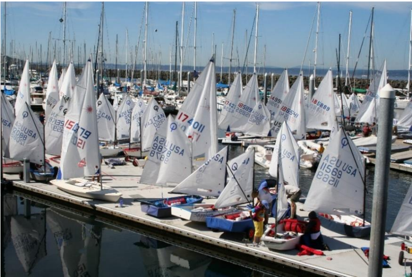
Seattle Yacht Club hosts PNW Junior Olympics Regatta.