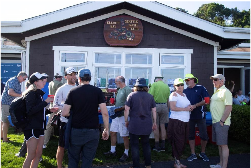
Tri-Island Series Party at the Elliott Bay Marina clubhouse.