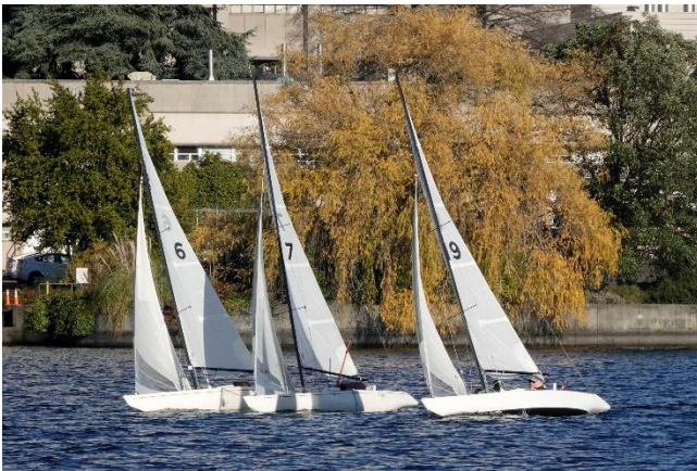
Mini-12's racing on Portage Bay

Every year we have seven series consisting of five regattas each. And with our friends at Royal Victoria Yacht Club and their ten boats, our two clubs alternate as host for an annual Inter-Club Team Race Regatta.