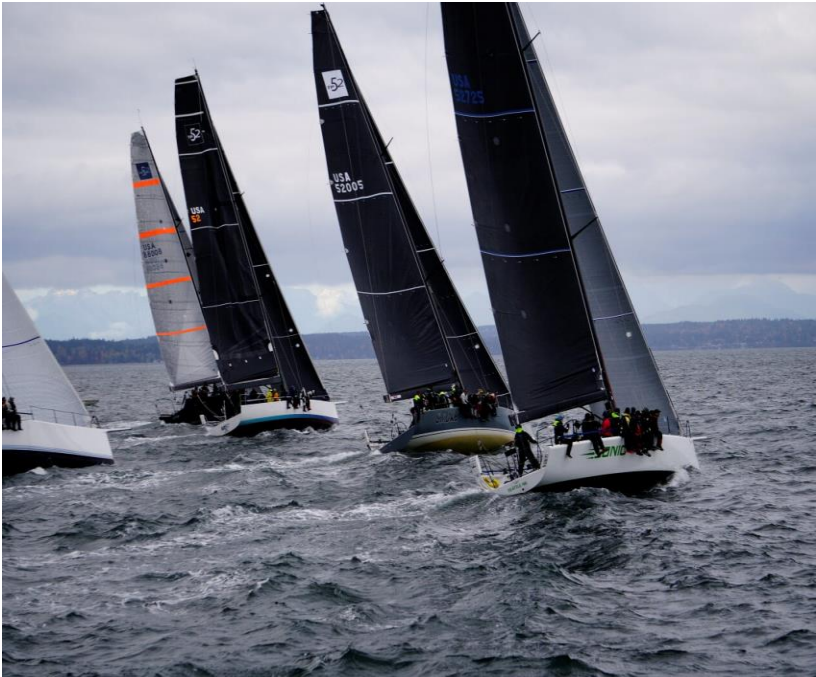
ORC start at an SYC regatta