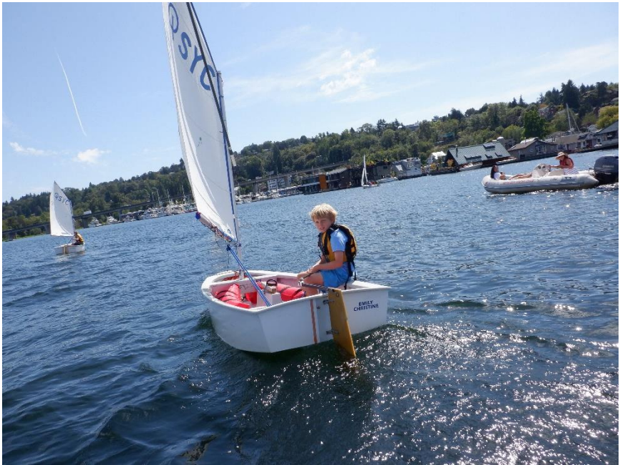
Opti sailing in Portage Bay

This year's program will run from June 15 to September 4. Classes run from 9:00 AM - 4:00 PM, Monday through Friday. Students can sign up for a week at a time, and for multiple weeks during the summer!!