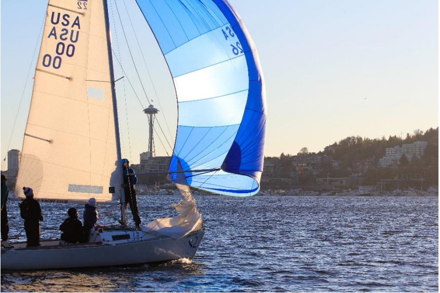
J/22 on Lake Union