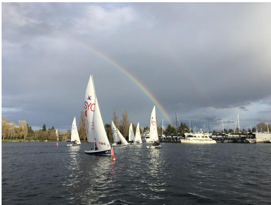
Vanguard 15's on Portage Bay