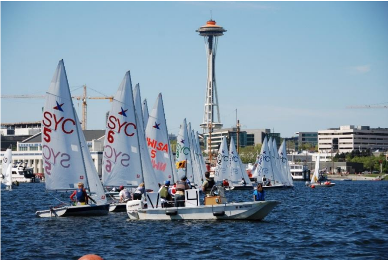
High School Sailing Championships on Lake Union.