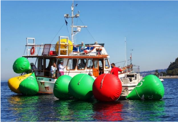
Race Committee Boat - Portage Bay