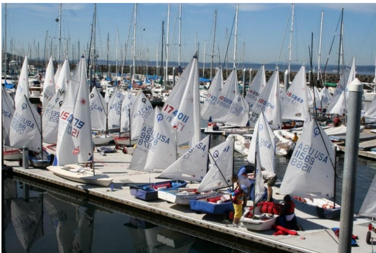
Seattle Yacht Club hosts the annual PNW Junior Olympics Regatta.