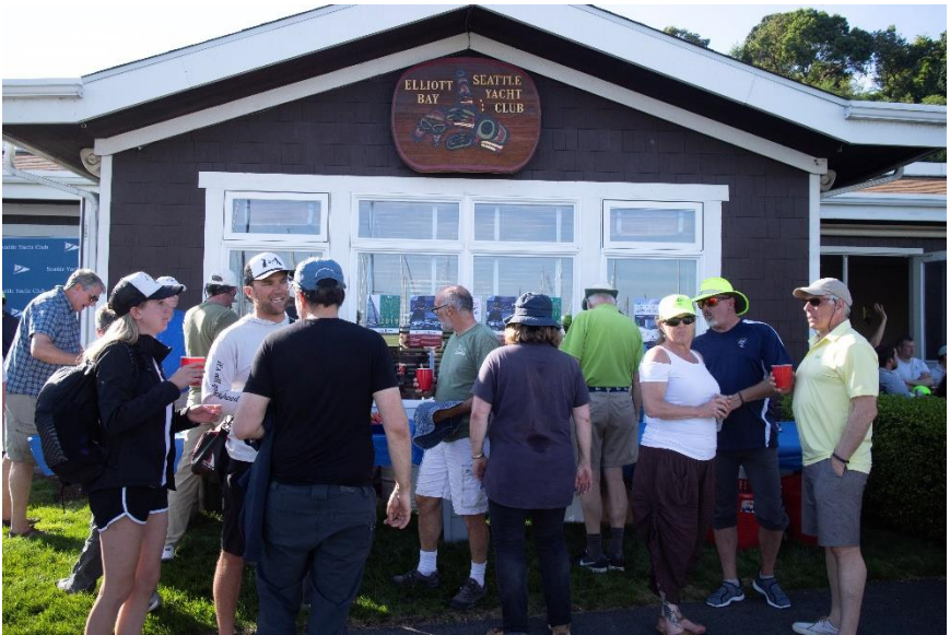
Annual Tri-Island Series Party at the Elliott Bay Marina clubhouse, following the Blake Island Race.