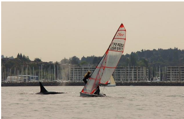
Sailors at Jr. Olympics avoid feeding the Orcas!