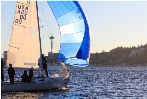
J/22 on Lake Union