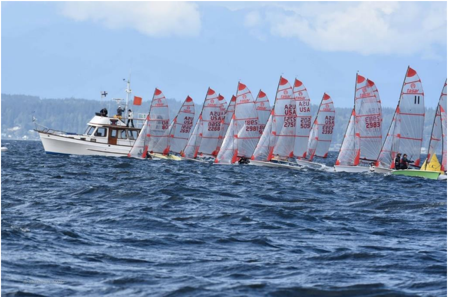
2020 Tasar NorthAmericans at Shilshole

1807 East Hamlin Street Seattle, Washington 98112 www.SeattleYachtClub.org