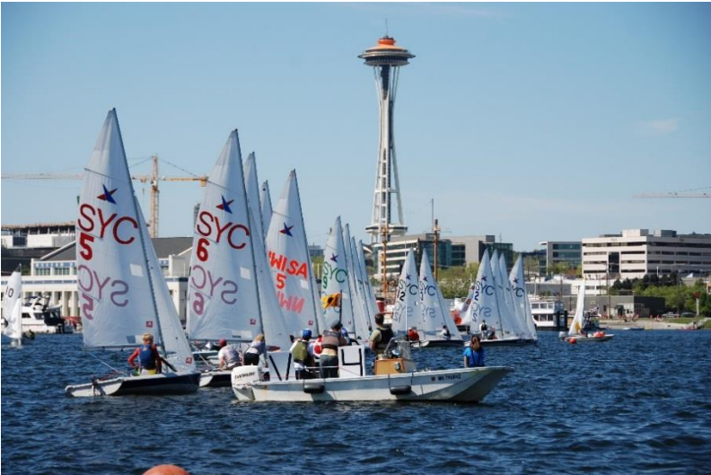
High School Sailing Championships on Lake Union.