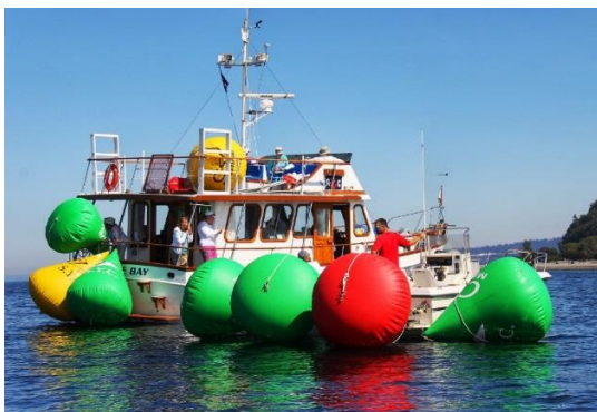
Race Committee Boat - Portage Bay