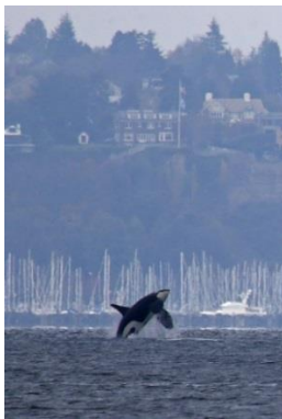
Save the Orcas